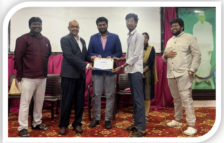
Certificate Presentation by the Resource Person & the Principal